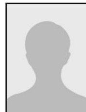
Vacant Term TBD -2024